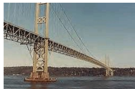
Tacoma Narrows Bridge (pre 2007)

I looked at him and approached carefully. He bristled and yelled, ‘don’t you dare come any closer! You just want to grab me, and I’m not going to let you do that!’ To tell the truth, if I